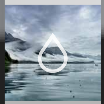
Water is our passion. We care about every drop and our CSR commitment goes even beyond one element alone: We strive to protect all of our planet's resources for future generations.

GROHE America 160 Fifth Avenue, 4th Floor New York, NY 10010 Tel.: 1-800-444-7643 www.grohe.us