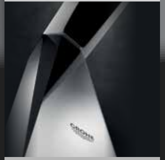
Our highly awarded design DNA's recipe for success is simple: Merging the contemporary and the timeless into products that feel like they were designed just for you.