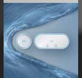
We constantly drive innovation to enrich your everyday water experience, delivering smart solutions on the path of the digitization of water.