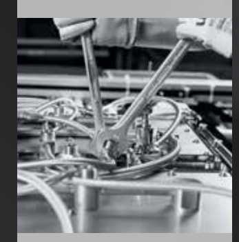
From the first design sketch to the final product to after-sales services: Our customers can rely on our engineered in Germany sense of perfectionism.