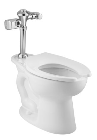
Madera™ Toilet shown with Ultima Sensor-Operated Diaphragm Flush Valve