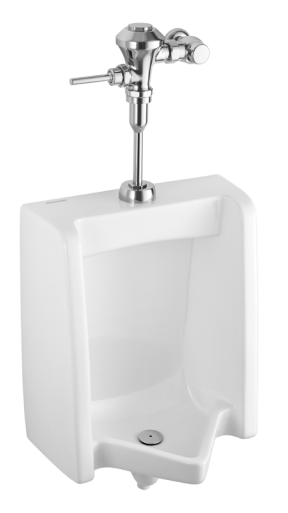
Washbrook® Urinal shown with Ultima™ Manual Diaphragm Flush Valve