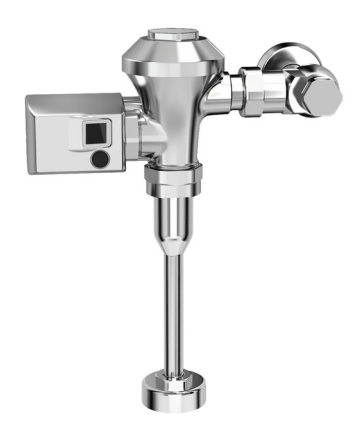
6145SM Series Sensor-Operated Urinal Flush Valves (0.125, 0.5 and 1.0 gpf)*