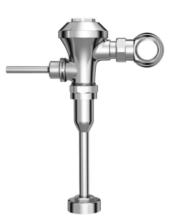
6145 Series Manual Urinal Flush Valves (0.125, 0.5 and 1.0 gpf)*