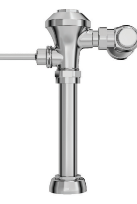
6147 Series Manual Toilet Flush Valves (1.1, 1.28 and 1.6 gpf)*