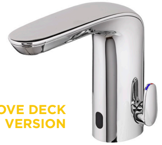
ABOVE DECK MIXING VERSION

Step into the next generation of Selectronic products by American Standard with the clean, sleek NextGen faucets. The NextGen Selectronic faucets showcase American Standard's exclusive new SmarTherm™ Safety Shut-Off that automatically prevents user scalding. The simple, integrated design allows for easy installation and maintenance.