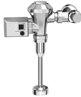
6145SM Series Sensor-Operated Urinal Flush Valves (0.125, 0.5 and 1.0 gpf)*