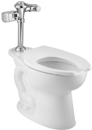
Madera™ Toilet shown with Ultima Sensor-Operated Diaphragm Flush Valve