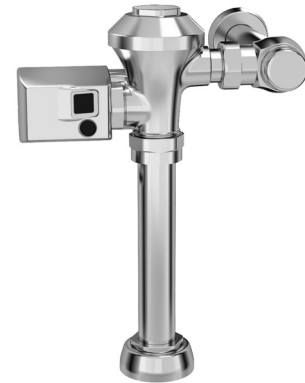
6147SM Series Sensor-Operated Toilet Flush Valves (1.1, 1.28 and 1.6 gpf)*

Clinic Sink Flush Valves are also available.