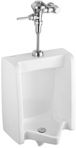
Washbrook® Urinal shown with Ultima™ Manual Diaphragm Flush Valve