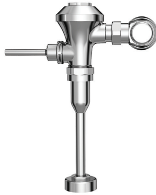
6145 Series Manual Urinal Flush Valves (0.125, 0.5 and 1.0 gpf)*