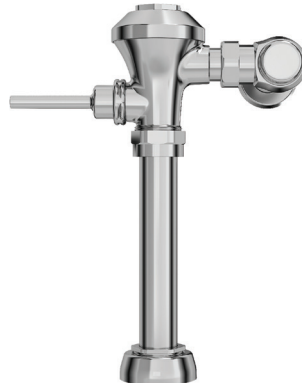
6147 Series Manual Toilet Flush Valves (1.1, 1.28 and 1.6 gpf)*